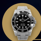
PRIZE Rolex® Submariner

In order to consolidate the link with the world of luxury watches, each collection will be enriched by the awarding of a watch to a person randomly drawn from a mathematical library provided by an external body, in order to ensure maximum transparency.